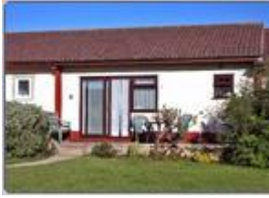
Sandways 2 bed bungalow