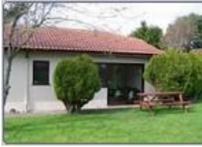
Weston Lodge Semi-detached bungalow

A 2 bed end of terrace bungalow. Sleeps 4. Picnic table in lovely gardens to front ( south facing ). Set in spacious grounds. Close parking. TV / Freeview / HiFi. SORRY NO PETS.