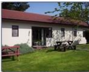
Swallows 2 Bed Terraced bungalow